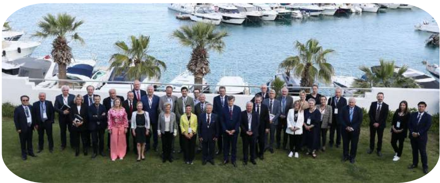
Izmir, Turkey - 2024