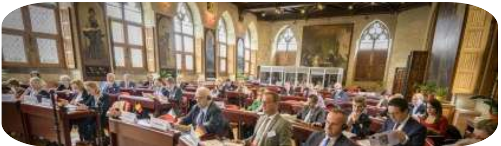
Louvain, Belgium - 2019

Please contact the secretariat to discuss membership and participation in JERTE.