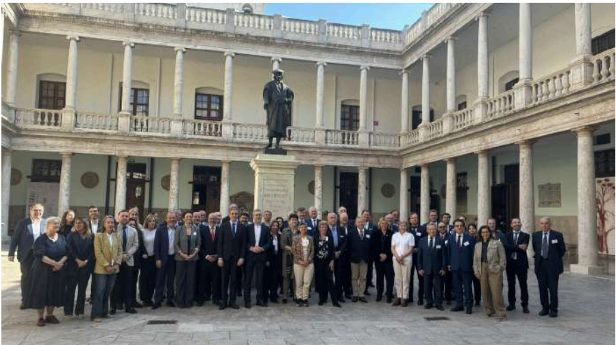
Valencia, Spain - 2025

30 years of experience serving the challenges of the State in European territories