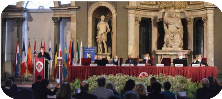
Florence, Italy - 2021

The work resulting from the JERTE is published in various journals or books.